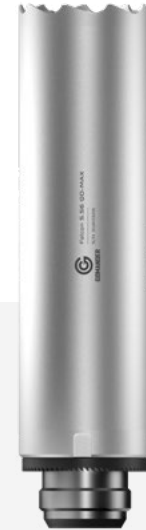
Falcon A2 5,56 QD-MAX