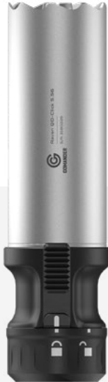
Raven A2 5,56 QD-CLICK

To mount it, you need one of our dedicated muzzle devices: Quadron Evo – Flash hider Raptor – Muzzle brake