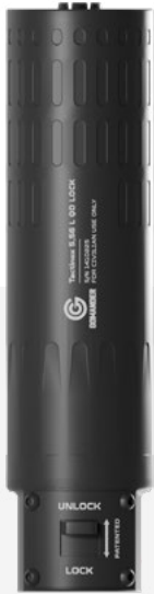
Tactinox 5,56 QD-LOCK