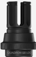
Quadron Evo, Raptor or Pentrax QD-LOCK

Save time. Simply: screw on, lock – and you're done. The suppressor stays securely in place, even during continuous fire.