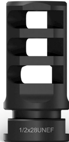
Raptor A2 5.56