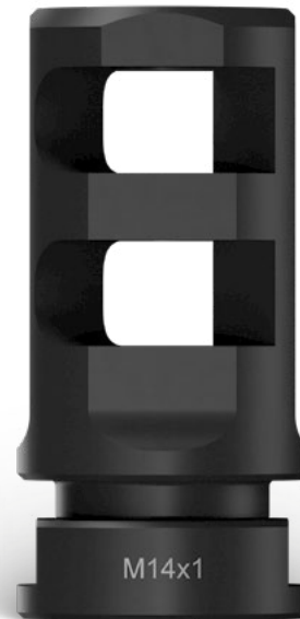
Raptor A2 7.62

* Available in wide range of thread types